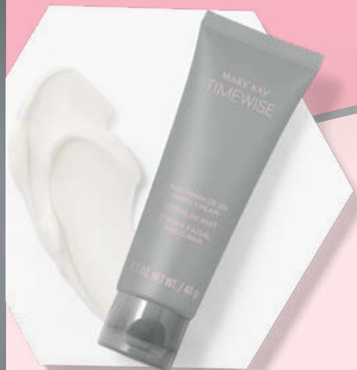
TIMEWISE ® AGE MINIMIZE 3D ® NIGHT CREAM