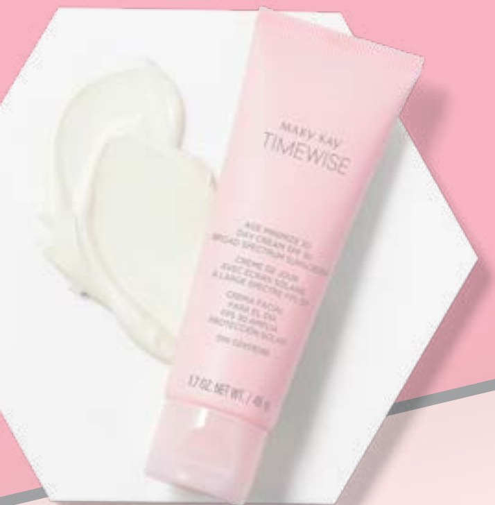
TIMEWISE ® AGE MINIMIZE 3D ® DAY CREAM SPF 30 BROAD SPECTRUM SUNSCREEN*